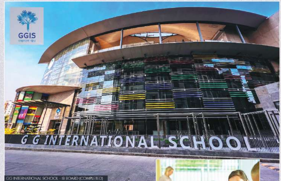
GG INTERNATIONAL SCHOOL - IB BOARD (COMPLETED)