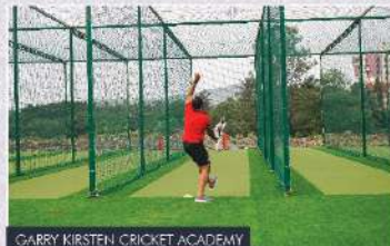
GARRY KIRSTEN CRICKET ACADEMY