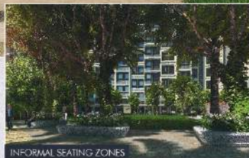
INFORMAL SEATING ZONES