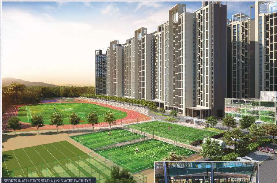
SPORTS & ATHLETICS STADIA (12.5 ACRE FACILITY*)