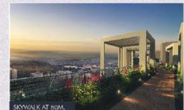
SKYWALK AT 80M.