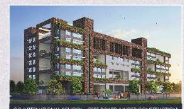
GG INTERNATIONAL SCHOOL - CBSE BOARD (UNDER CONSTRUCTION)

GG international school CBSE board (under construction)