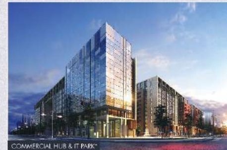
COMMERCIAL HUB & IT PARK*