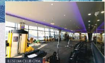
ILSEUM CLUB GYM

Skywalk at 80m. height with stunning views