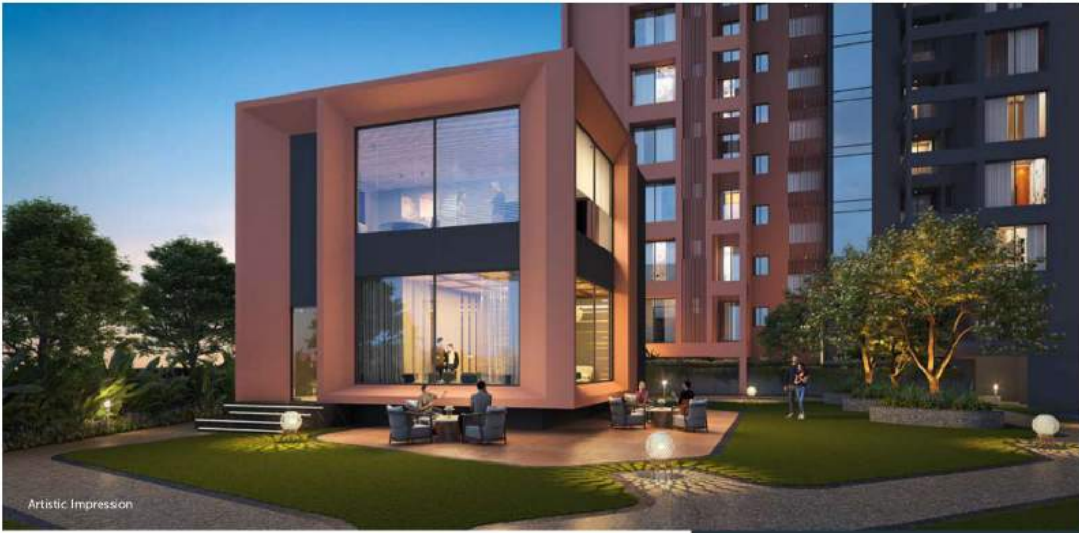
OPULENT CLUBHOUSE WITH A BEAUTIFUL VIEW