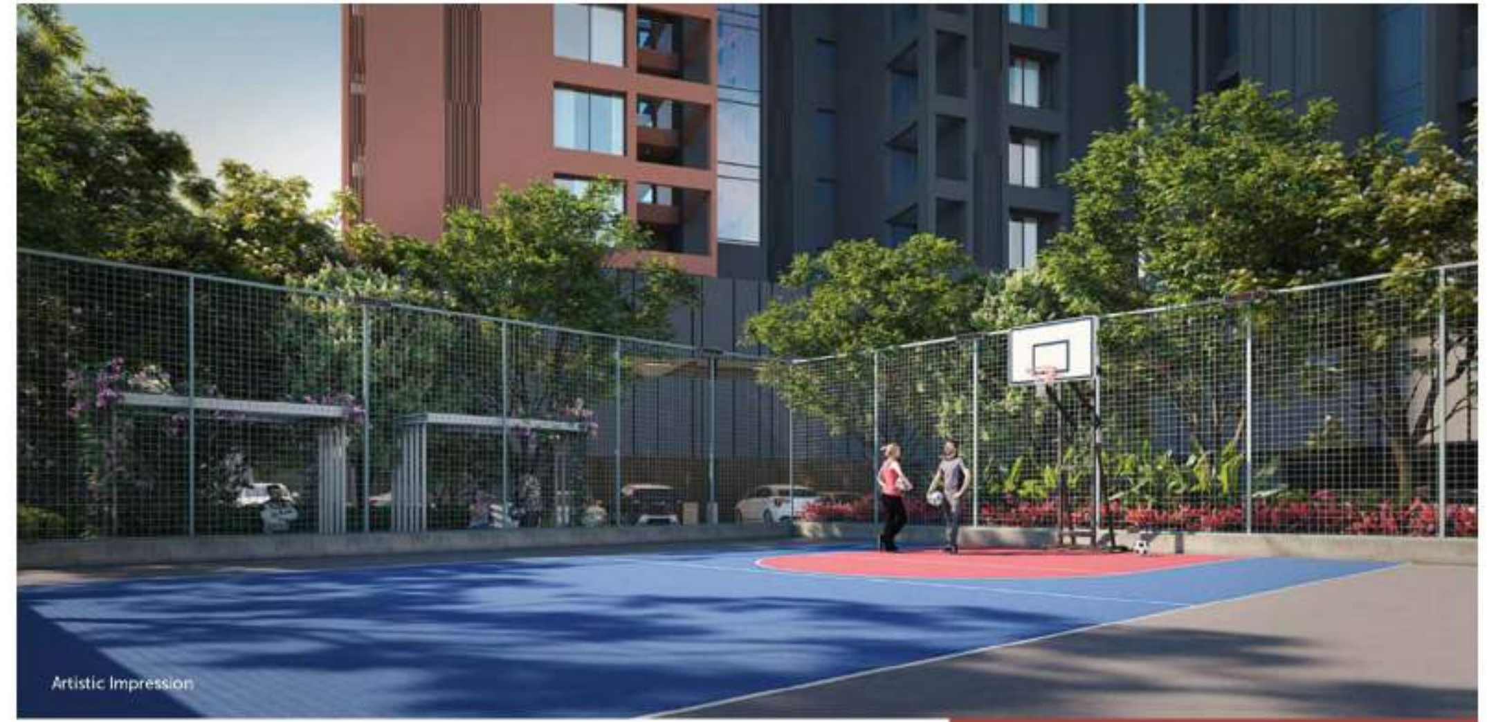
GAME CHANGING SPORTS COURTS