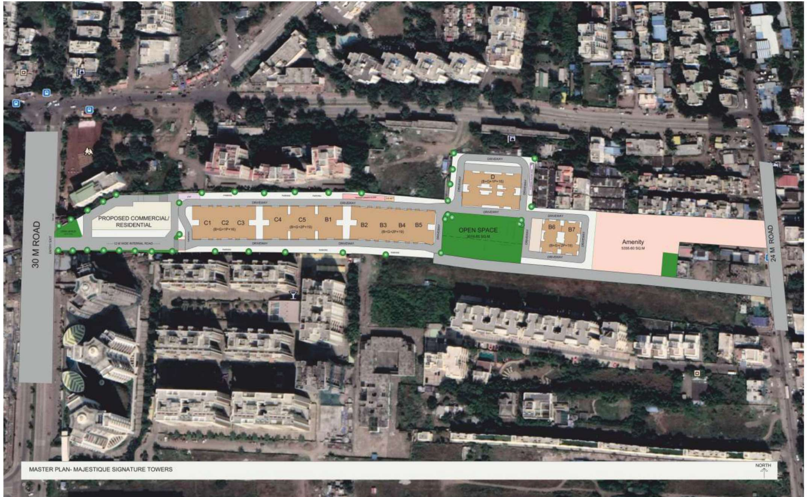
MASTER PLAN- MAJESTIQUE SIGNATURE TOWERS