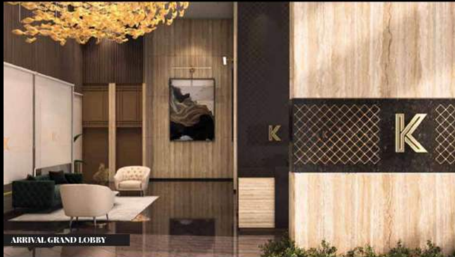
ARRIVAL GRAND LOBBY