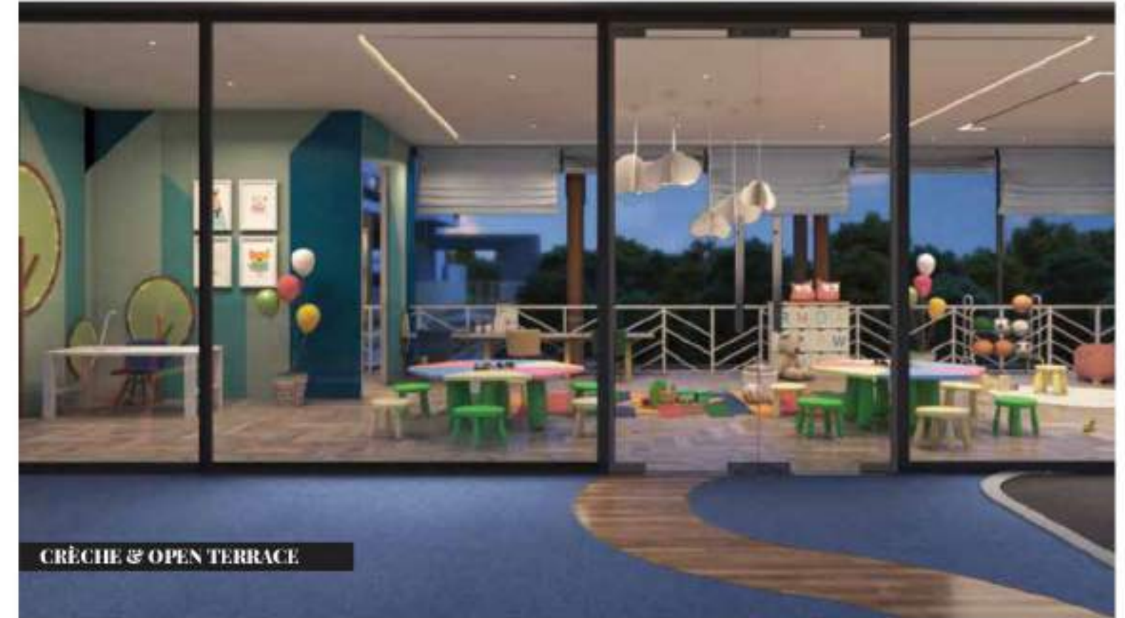
CRÈCHE & OPEN TERRACE